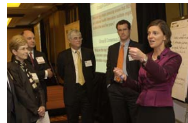
2010 Annual Member Meeting

JOIN US on May 10 for NEHI's Annual Member Meeting and Forum on the theme of Innovating for Value in Health Care . Participate in interactive working sessions. Network with invited thought leaders. Register now .